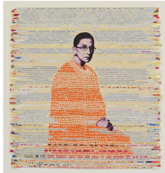
Figure 2: An example of the Torres Works, titled “A Judge Grows in Brooklyn”

Plaintiff asserts that it is the exclusive licensee of Afanador’s photographs, including the photograph at issue in this case. [Doc. 29, p. 7]. Plaintiff and Afanador entered into an agreement (the “Agreement”) on December 14, 2015. 2 [Doc. 29-6, p. 3]. Pursuant to the Agreement, Afanador retained Plaintiff as his