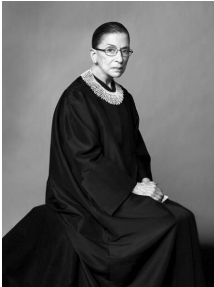
Figure 1: The Afanador Work, titled “Ruth Bader Ginsburg”